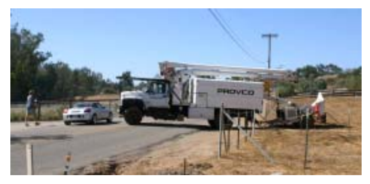
Local resident directs traffic around runaway PROVCO truck

SDG&E contracts with PROVCO for tree trimming services and allows their trucks to park directly on native grass on the hilly slope located in a rural residential neighborhood. The Elfin Forest / Harmony Grove Town Council has repeatedly asked SDG&E to move the trucks which are an eyesore as well as a safety and fire hazard. A large storage container has also been placed on the property.